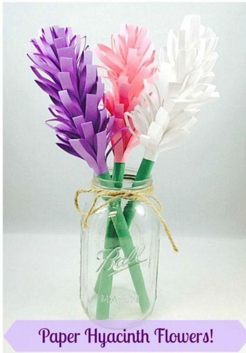
Paper Hyacinth Flowers!