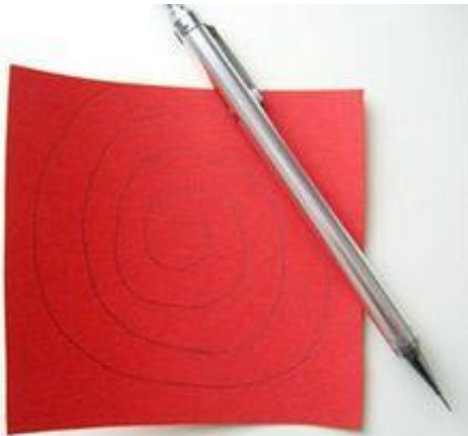
step 1: draw a spiral on a 4x4" square sheet of paper.